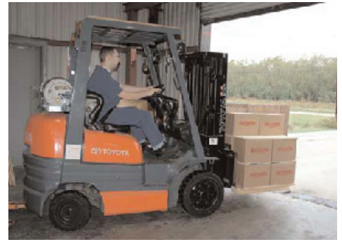
Remanufactured pumps ready for loading and shipping to customers

Through EDI [Electronic Data Interchange], Gilkes is sure of up-to-the-minute schedules from its key customers. These schedules include firm orders and a planning horizon forecast, so recording returned core is vitally important. Much of our demand for remanufactured pumps is for Caterpillar and Cummins and subsequently for distribution throughout the US and worldwide, so skilful management of inventory and shipping is vital.